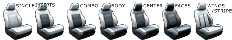
TWO-TONE & PERFORATION STYLES *SEAT STYLES VARY, SOME OPTIONS MAY DIFFER.